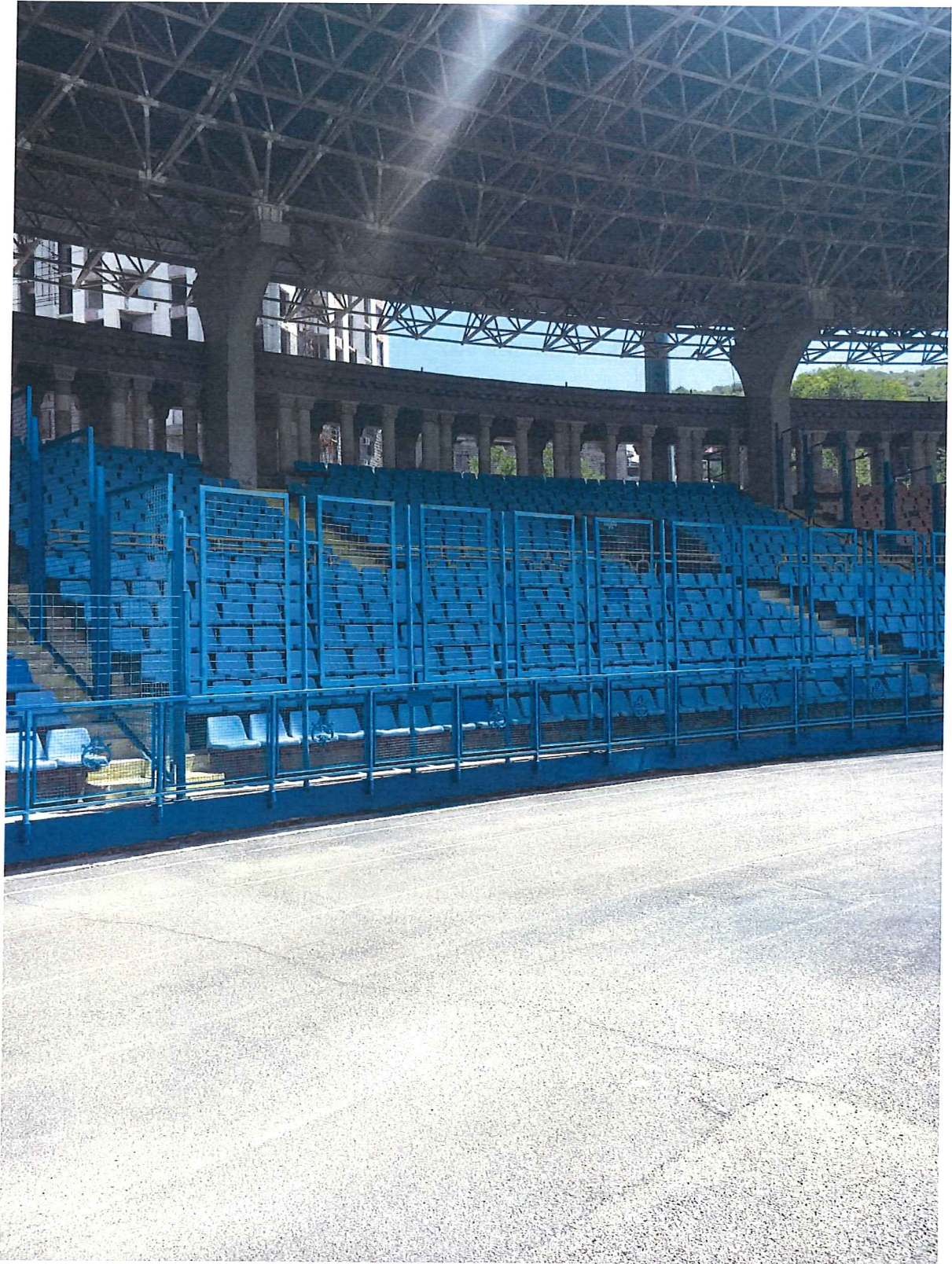
Area for Away Fans