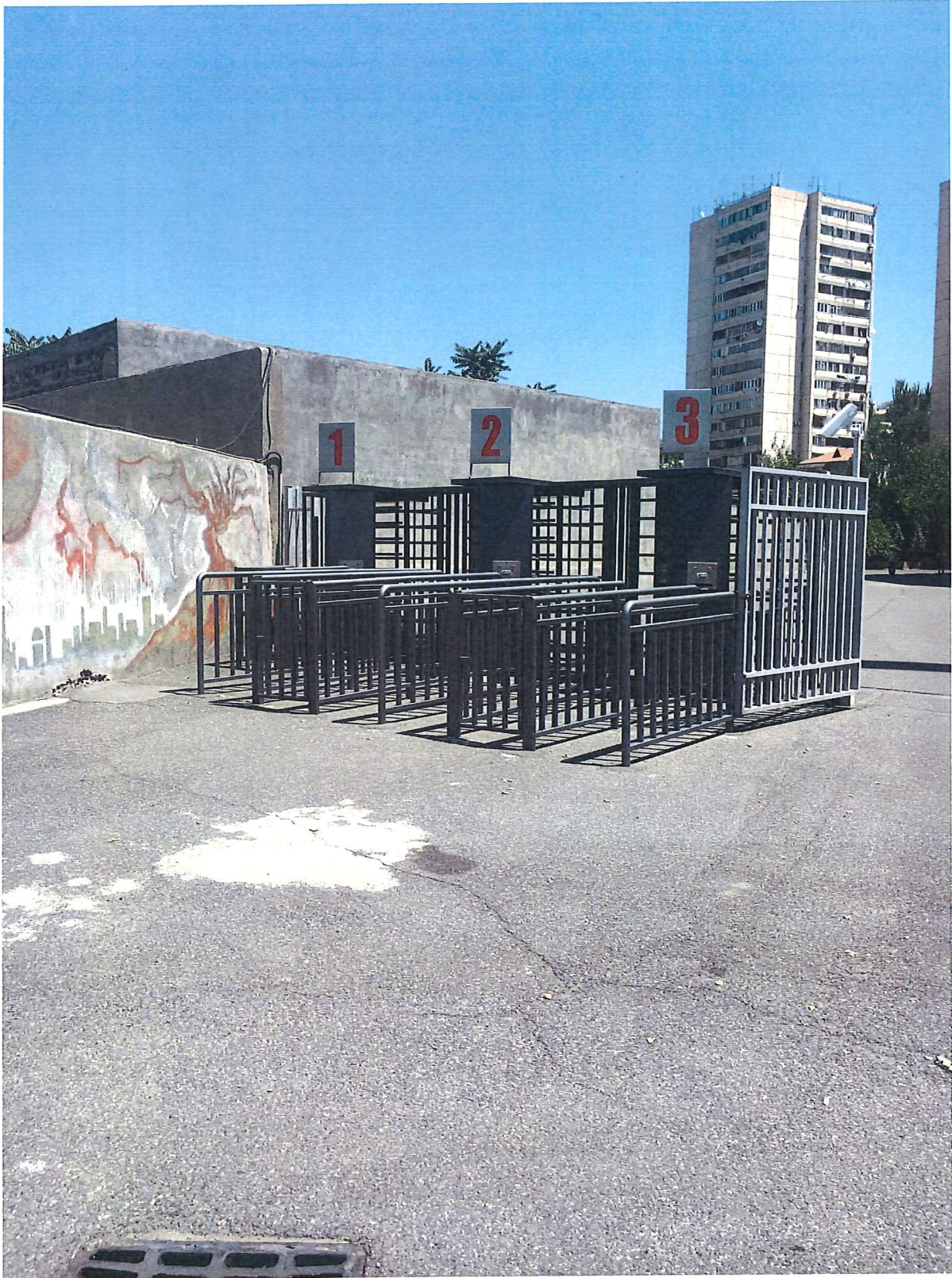
Turnstiles for all supporters at North West corner.