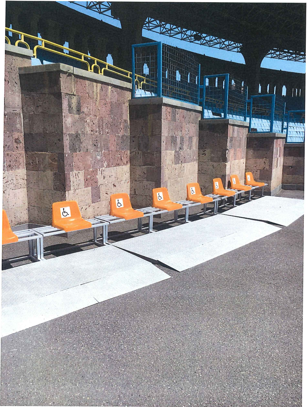
Disabled Section for all fans